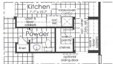
OPTIONAL BUTLER'S PANTRY