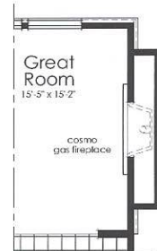
OPTIONAL COSMO GAS FIREPLACE LOCATION AT GREATROOM