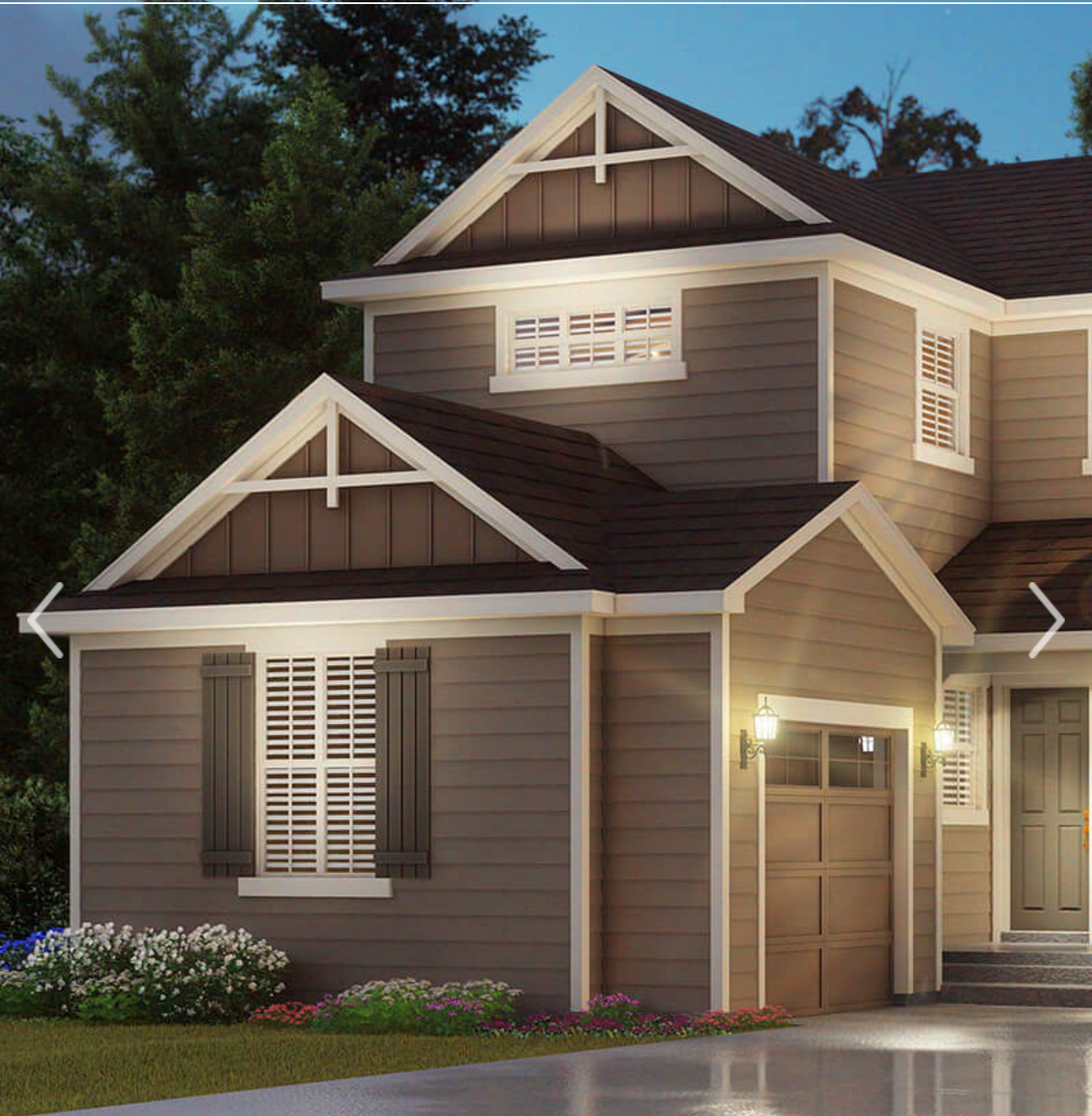
| | | | The Trail Ridge