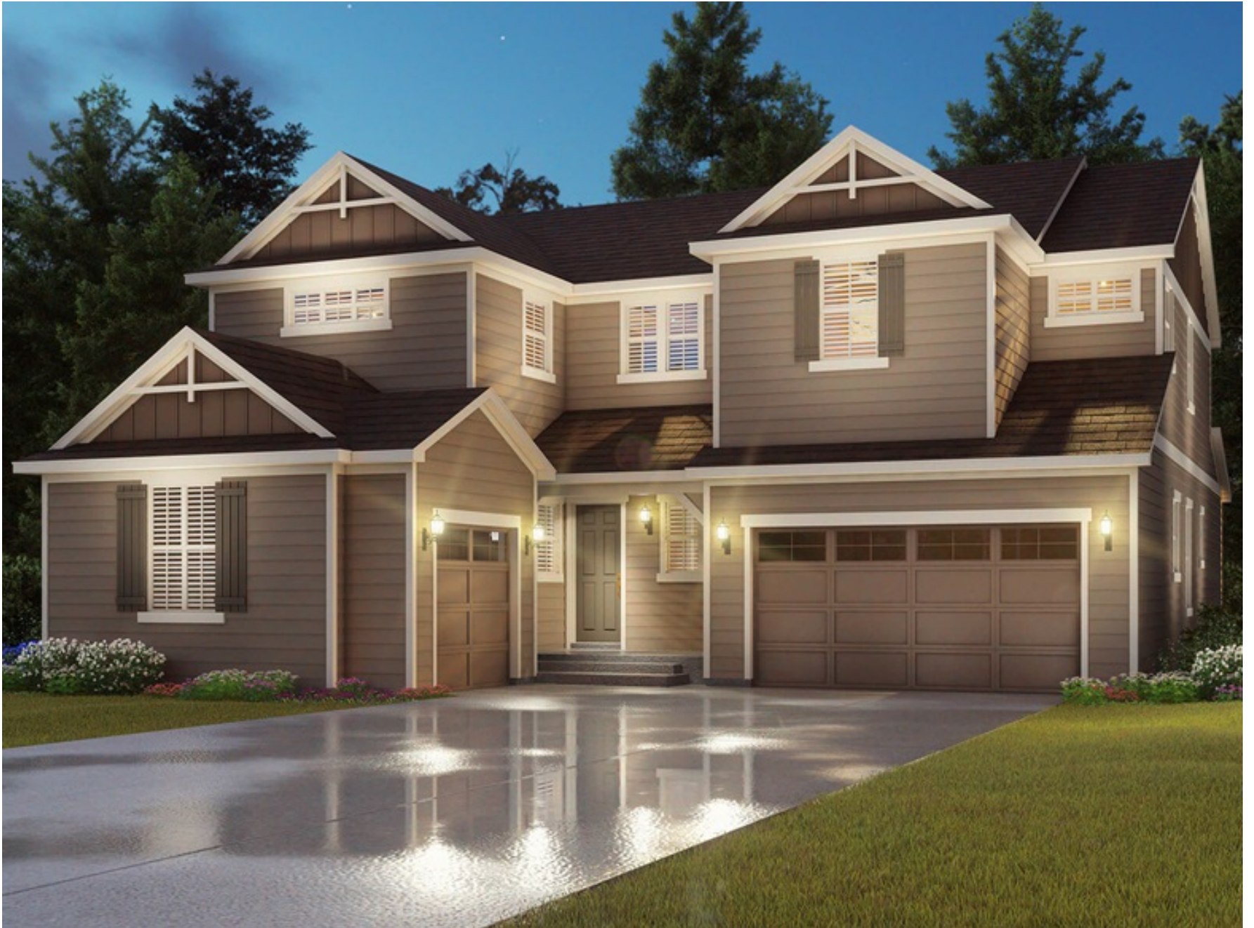
3 Car Garage

A Quick Move-in means you don't have to start from scratch (or dirt, in this case), plus, upgrades and design choices were made by our team of professional designers.